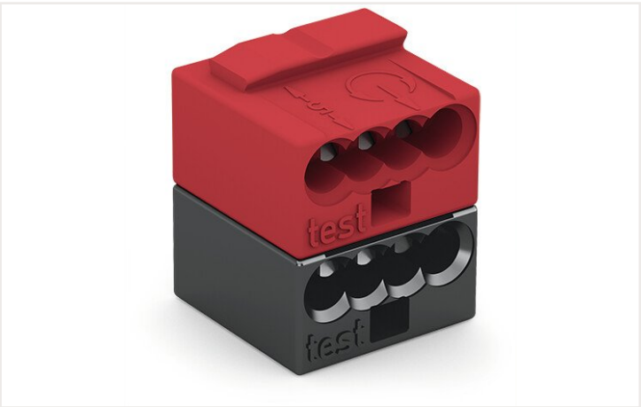
Color: dark gray/red