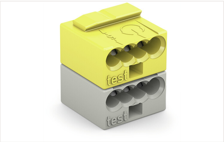
Color: light gray/yellow