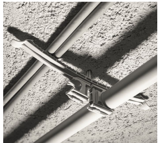
The KB cable brackets have been developed for the section installation of wiring harnesses.