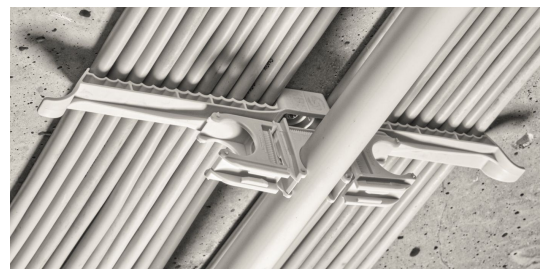
An additional EC Euro-Clip for Pipe installation can be mounted at the center of the KBS.