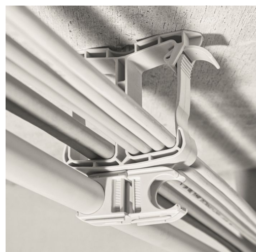
The SH holder forms a closed ring around the sheathed cables and can be re-opened using a handle.